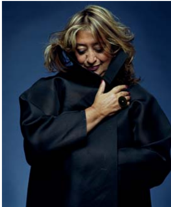
Zaha Hadid, Zaha Hadid Architects

Gross Max Landscape Architects , Edinburgh