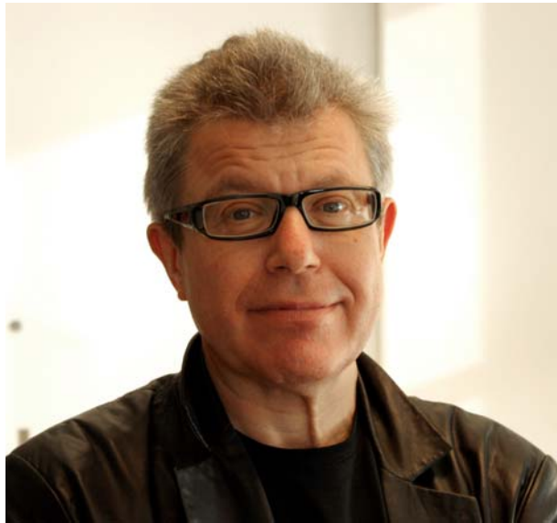
Daniel Libeskind, Studio Daniel Libeskind