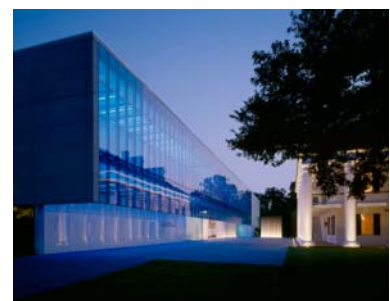
Hilliard Art Museum, ULL