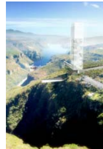
Guggenheim Museum, Guadalajara