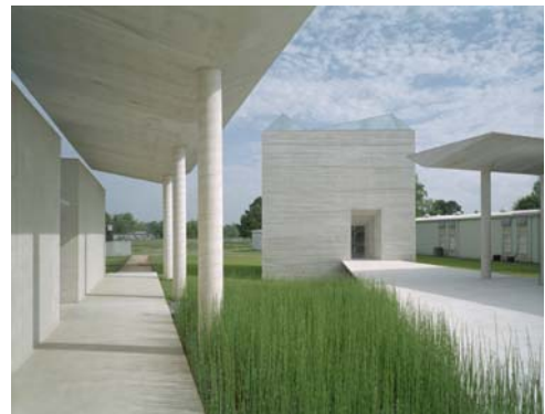
Holy Rosary Catholic Church, St. Amant, LA