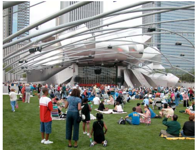
Pritzker Pavilion, Chicago