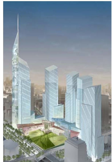
World Trade Center Master Plan, New York