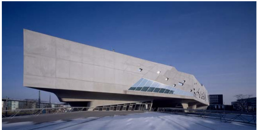
phaeno Science Centre, Wolfsburg, Germany