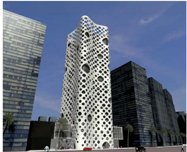
Commercial Tower, Dubai