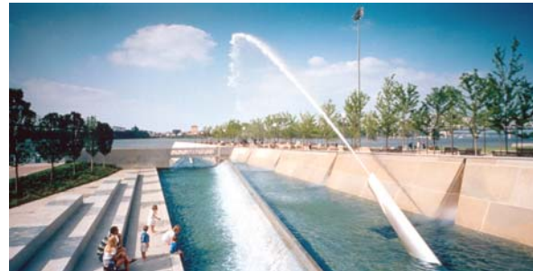
Louisville Waterfront Park